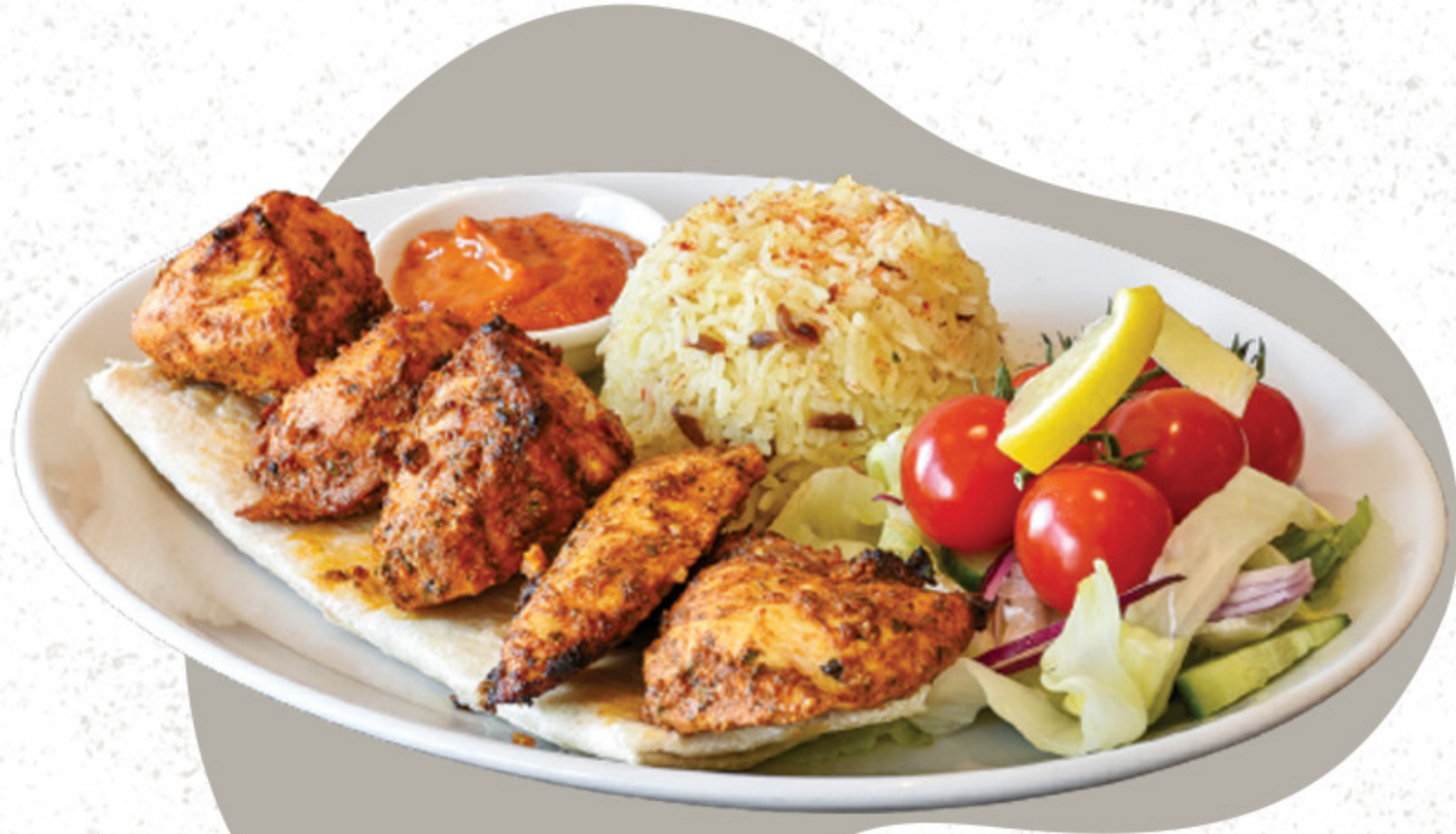
Mills Chicken Shish