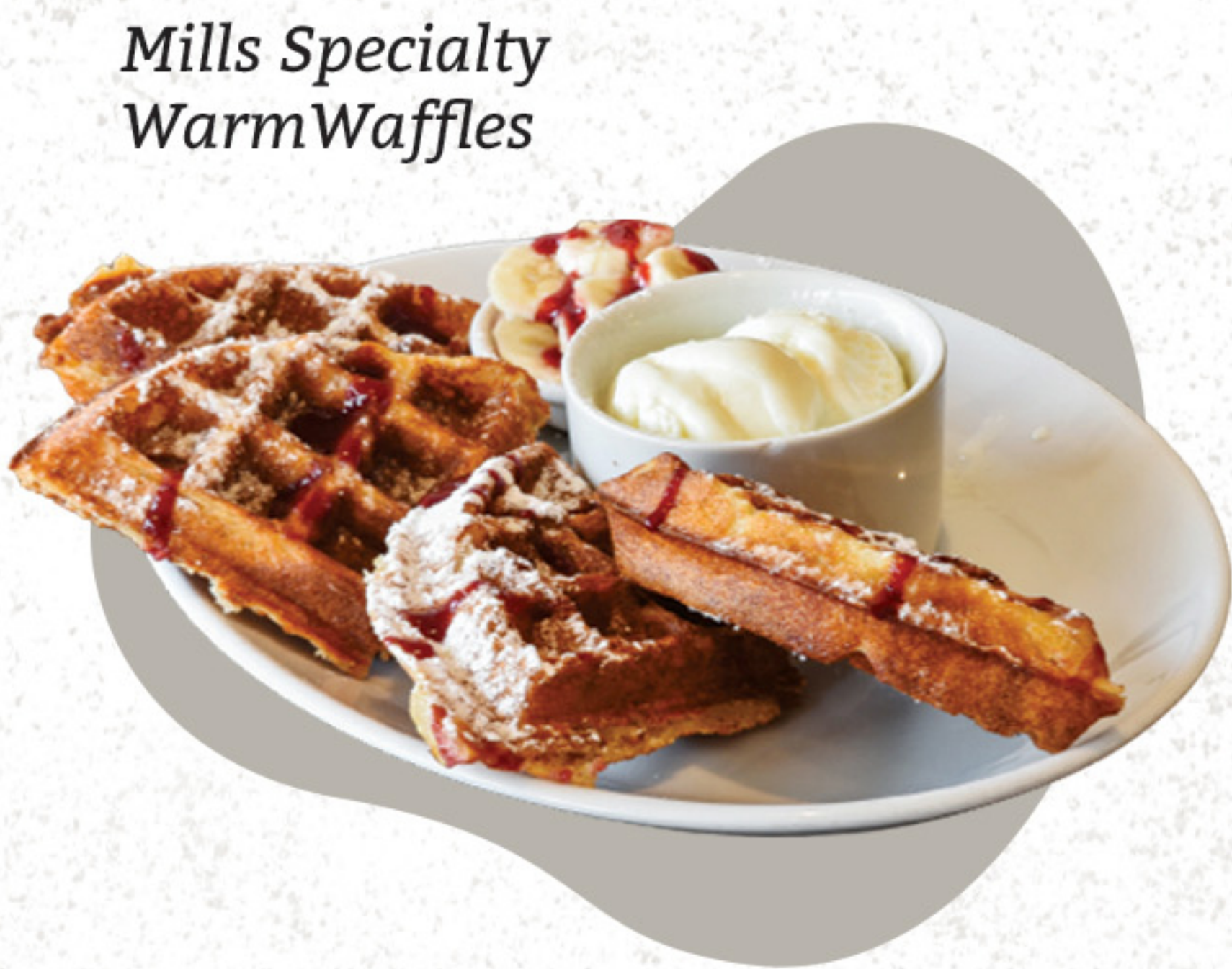
Mills Specialty WarmWaffles